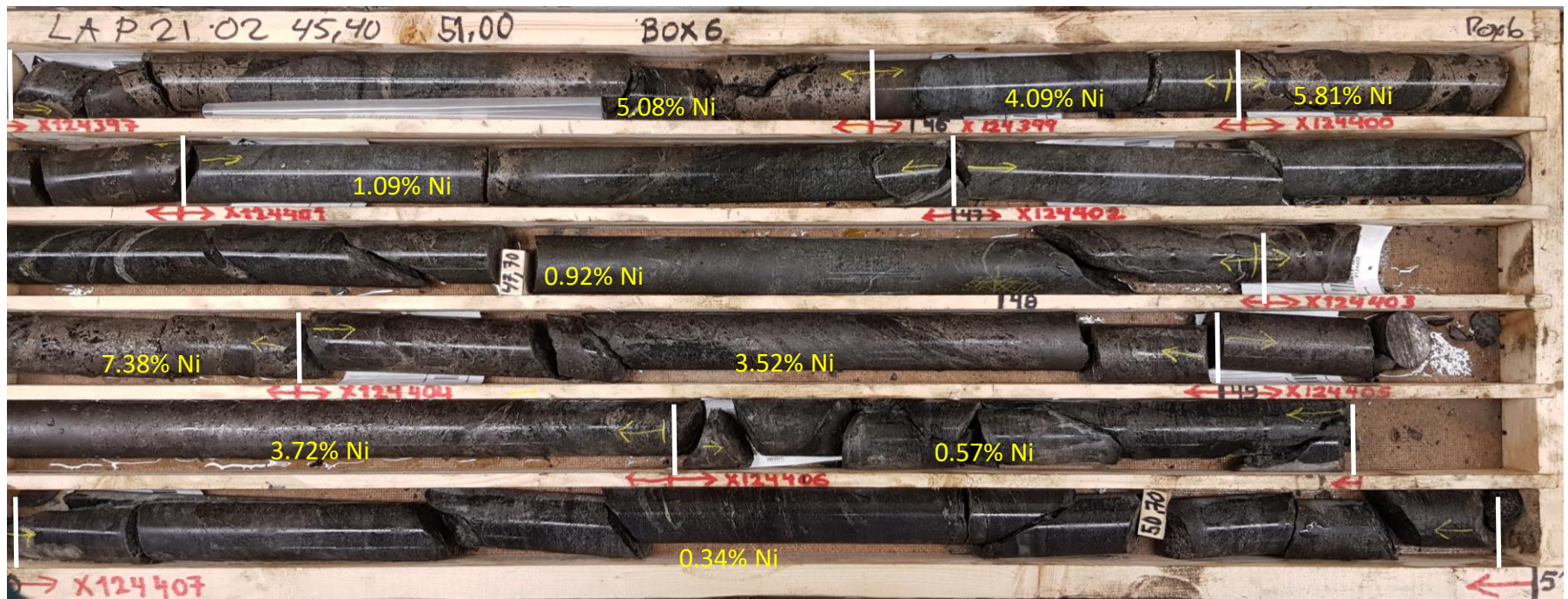
One-metre long core box